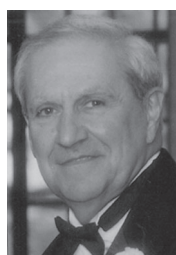
George Zainea Detroit Bowling Hall of Famer January 14, 1932 - June 5, 2019